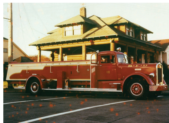
Vintage fire truck in front of Log House Museum

Please be sure and visit our "Navigating to Alki" maps exhibit; it is a truly fascinating exhibit, and enlightening as to the development of Alki, as well as influences on the greater West Seattle area today! The exhibit will be on until late July in the small gallery.