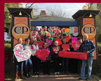
The historical society helps Historic Seattle advocate for C & P Coffee during the recent rescue campaign.