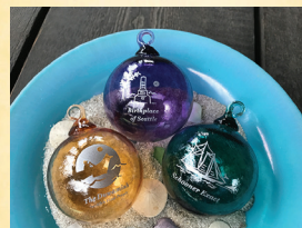
Three new "Glass from the Past" designs made available at 2017 Gala