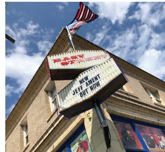
West Seattle's treasured music store, Easy Street Records