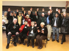
Cooper school alumni photo from Dec. 3, 2017 centennial celebration