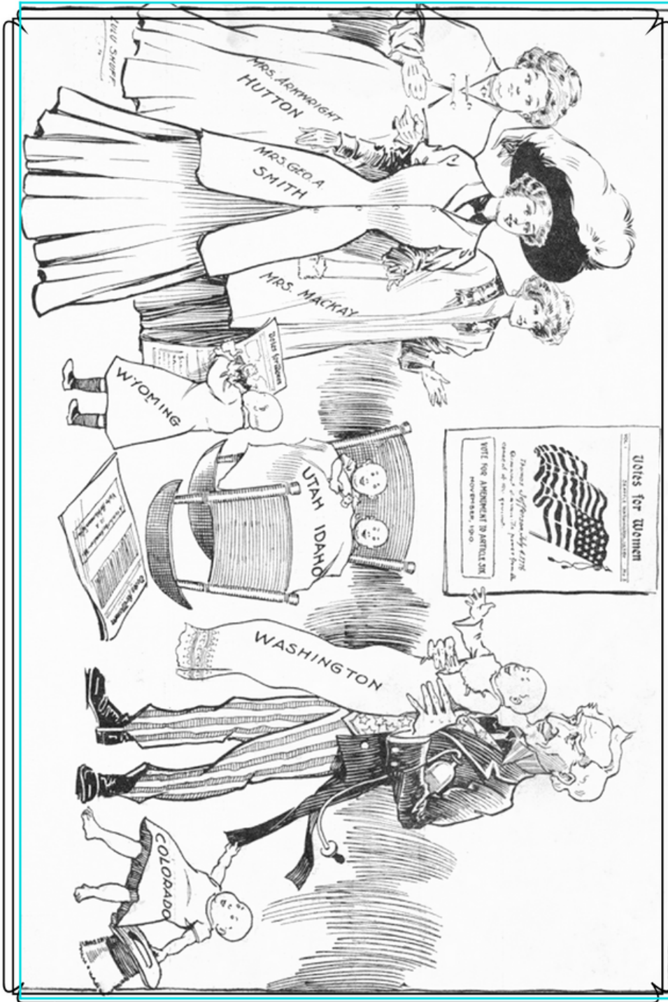
Exhibit Activity Book